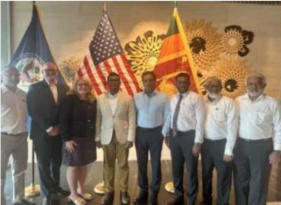
FTZMA meets Trade & Commercial Officials of US Embassy, Colombo for a briefing session regarding the SelectUSA.

MAIN SPONSORS OF 45 TH AGM OF FTZMA HELD AT UNION BALLROOM, HILTON COLOMBO RESIDENCES