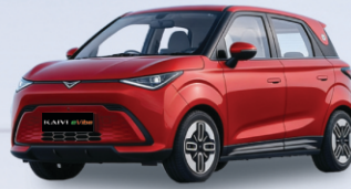
KAIY eVibe E04 | All Electric Range 300km (CLTC) Rs. 7.9Mn