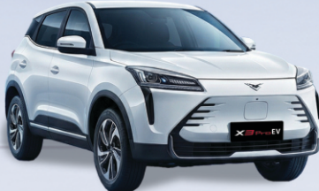
X3 Pro EV | All Electric Range 401km (CLTC) Rs. 12.9Mn