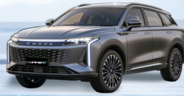
C9 PHEV | Combined Drive Range 1,100km Rs. 29.9Mn