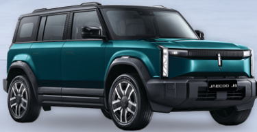
JAECCO J6 | All Electric Range 430km (NEOC) Rs. 20.9Mn