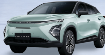
OMODA E5 | All Electric Range 505km (NEOC) Rs. 18.9Mn