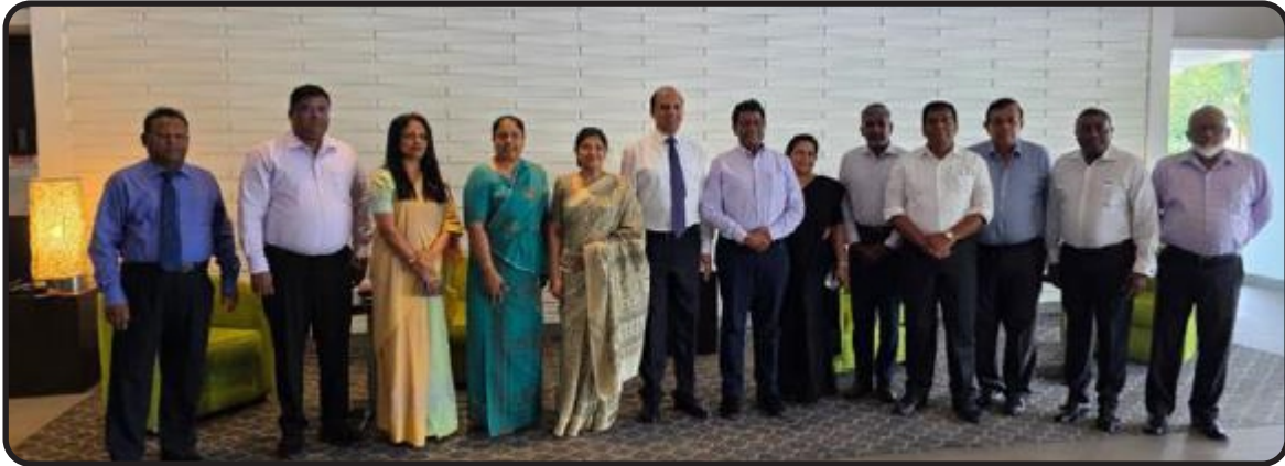
FTZMA host a luncheon meeting with the chairman & high-ranking officials of BOI at Taj Vivanta – Airport Garden Gateway Hotel.