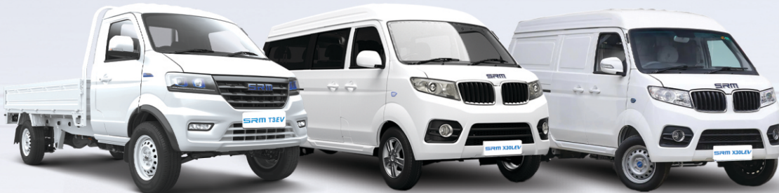
EV LIGHT COMMERCIAL VEHICLE | All Electric Range 300km (CLTC) Rs. 10.9Mn + VAT