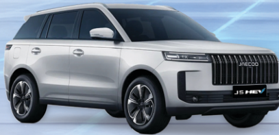
J5 HEV | 1.5 L Turbo GDI 5.3L / 100km Rs. 17.9Mn