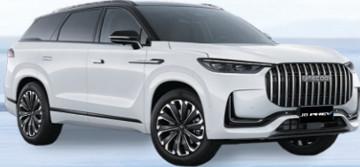
J8 PHEV | Combined Drive Range 1,100km | 7 Seater Rs. 31.9Mn