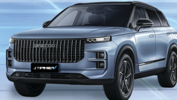
J7 PHEV | Combined Drive Range 1,200km Rs. 21.9Mn